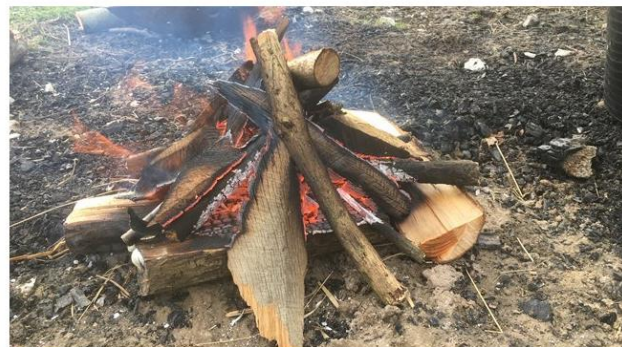
📷 Camp fire