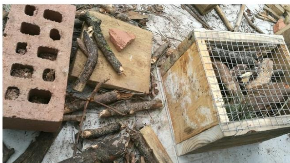
📷 Making a bug hotel