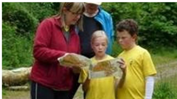
📷 Family orienteering challenge